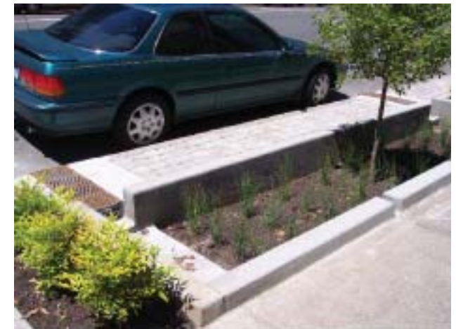
Bioretention basin along an urban roadway.

Care requirements should be considered when choosing plant species for LID drainage features. Trash and debris should be cleaned out of LID planting areas periodically, especially after large storm events. Drain inlets shall be cleaned out periodically.